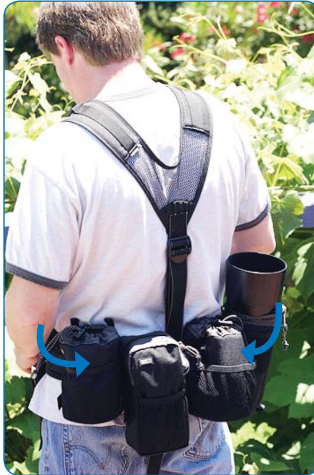
The Modulus components can slide halfway around the belt for easier access to your gear and for more comfort.