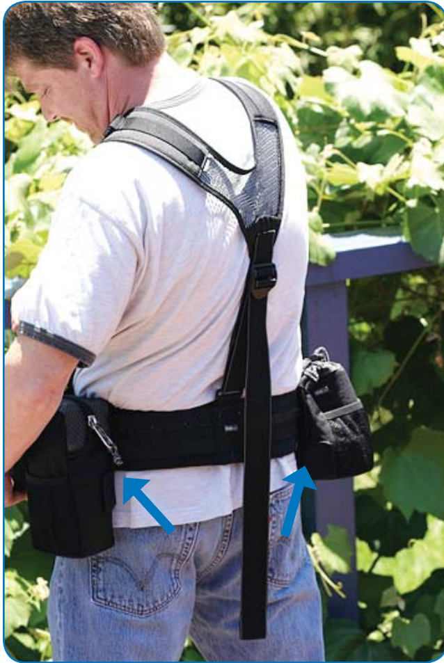
Modulus components can be attached to the rail on either side of the belt.

The Steroid Speed Belt is a heavier, more supportive belt than our lighter-weight Pro Speed Belt. This belt has a special "rail" which allows the Modulus components to be attached and "Rotate or Lock" halfway around the belt. It is also specifically designed to be used with our Pixel Racing Harness for more support. The Pixel Racing Harness (shown below) is sold separately.